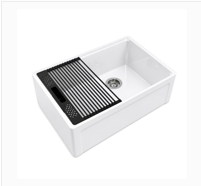
GLOSSY WHITE · SN105W3020

30-inch Country Apron-Front Fireclay Farmhouse Workstation Kitchen Sink