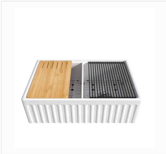
GLOSSY WHITE · SN104W3320D

33-inch Fluted Apron-Front Fireclay Farmhouse Workstation Kitchen Sink, Double Bowl