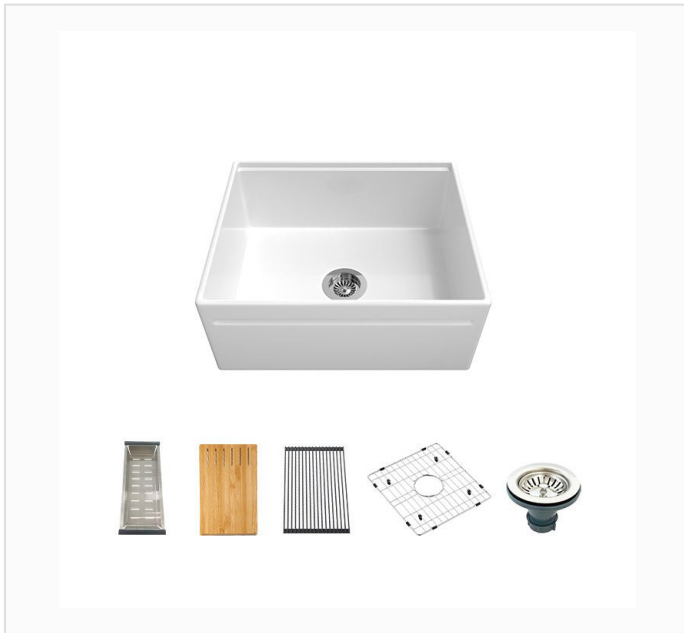
GLOSSY WHITE · SN101W2420

24-inch Reversible Apron-Front Fireclay Farmhouse Workstation Kitchen Sink