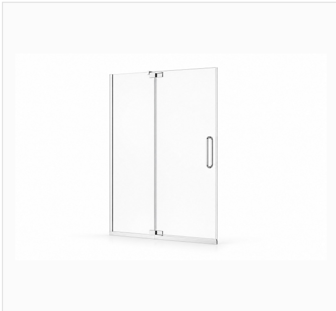
CHROME · SANIKB-NA-S06

NA-S06 frameless pivot shower door with inline fixed panel, chrome, 5/16"–3/8" glass, 30"–48" wide