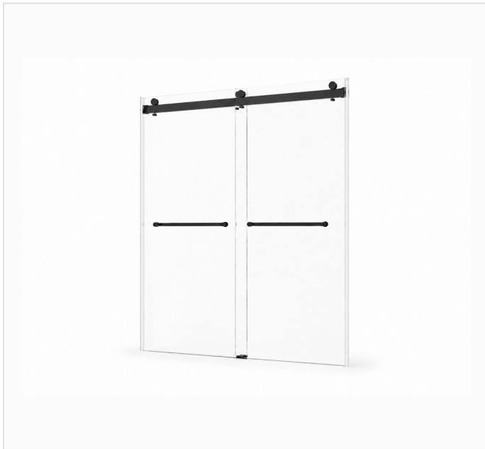
MATTE BLACK · SANIKB-NA-S01B

NA-S01B frameless bypass double-sliding bathtub/shower door, soft-close, matte black, 8/10 mm glass, 47"-72" wide