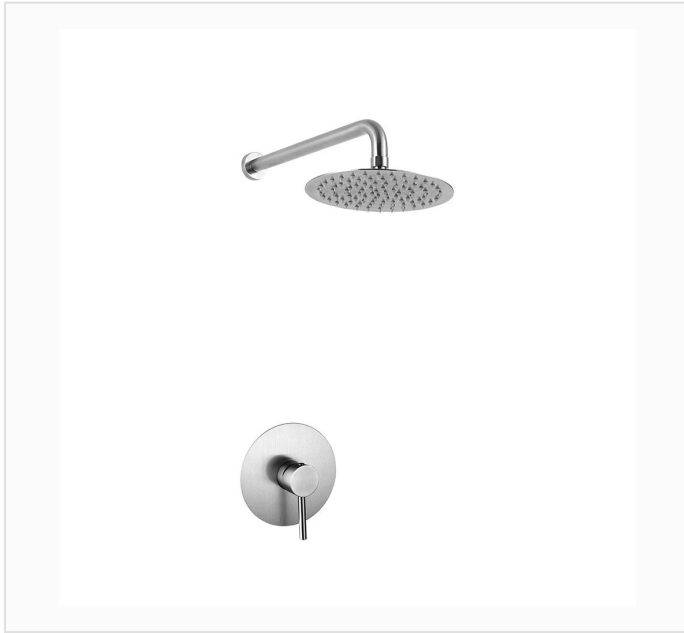
BRUSHED NICKEL · FYF-9011-1NP

Concealed shower set with Ø7.9" (200 mm) round rain head, 15.7" (400 mm) wall arm and single-lever in-wall valve