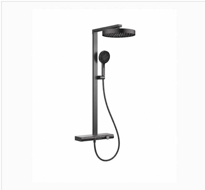
MATTE BLACK · F600106

Wall-mounted thermostatic shower system in matte black brass — rainfall head, handheld shower and shelf-style thermostatic valve; 22"